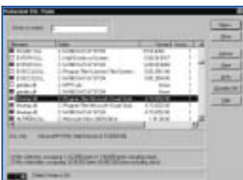
Figure 4 - Cleansweep's Redundant DLL Finder.