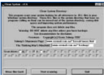
Figure 3 - Kevin Solway's ClnSys utility.

When I ran ClnSys for the first time, it found 42 redundant DLLs on my drives, with a total size of 11 MB. And this was on a fairly stable PC. If your users often try out shareware or evaluation programs, or if they have recently uninstalled some large applications, it is likely that ClnSys will find many more unwanted DLLs.